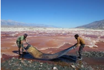
© Optics Division of the Metabolic Studio (Lauren Bon, Tristan Duke and Richard Nielsen), Lake Bed Developing Process , 2013

The press images in this pack are free of rights for the duration of the exhibition. They may not be cropped, modified or retouched. All reproductions, except for exhibition views, must be accompanied by the full captions and copyrights shown below.