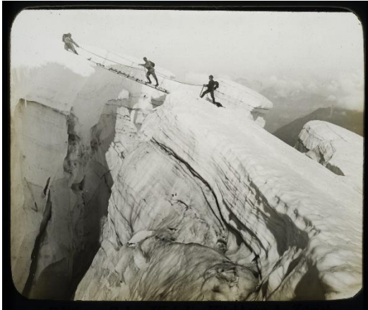
Three mountaineers crossing a crevasse on a glacier (unidentified). Magic lantern slide.