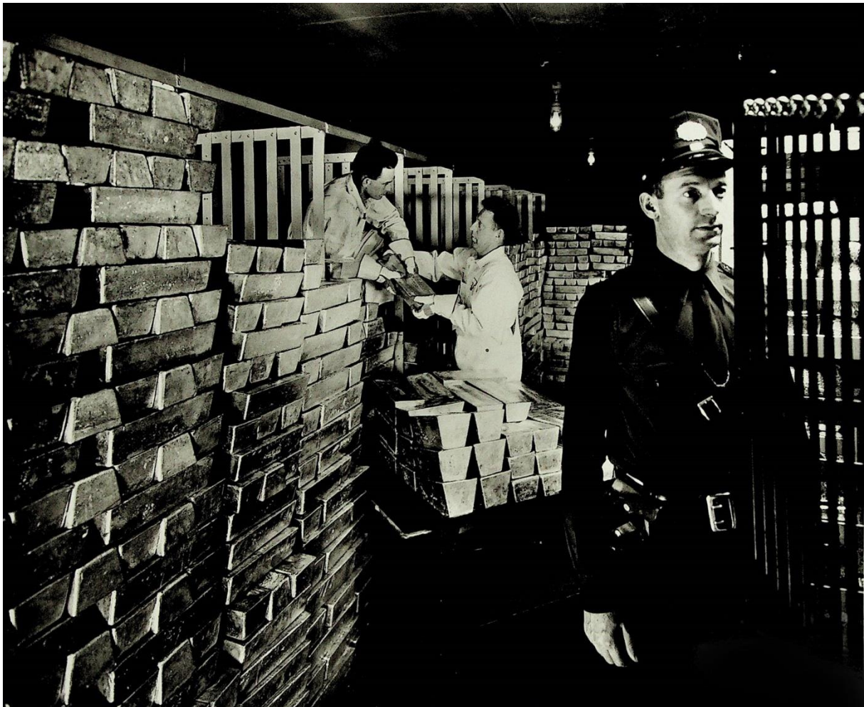
Unknown photographer, Silver bars in the Kodak vault , 1945. Used with permission from Eastman Kodak Company.