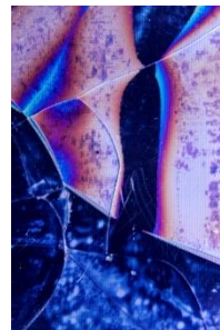
© Lisa Barnard, Broken mobile phone screen , Shenzhen, China, 2018.