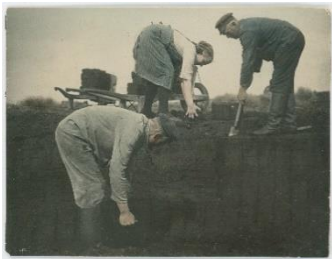
Peat extraction on Hartshoper Moor, ca. 1930