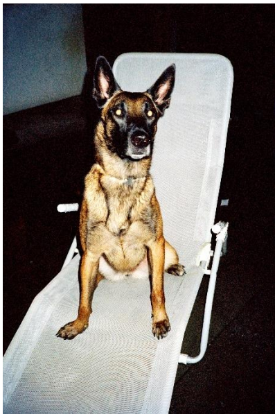
© Fabian Hugo, retired Swiss rescue dog, 2008

September 18th, 2025 - February 22nd, 2026